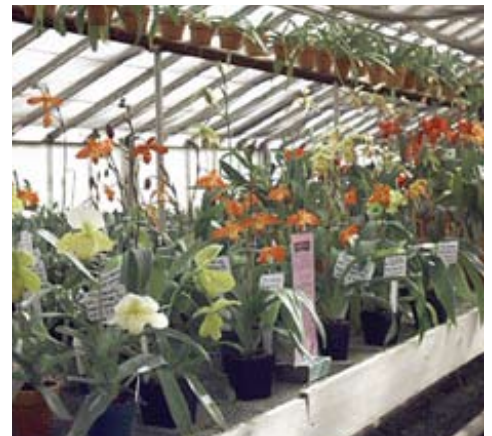
Orchids Garden Centre and Nursery

Residence Inn by Marriott 8400 Market Street (608) 662-1100 • 1-800-331-3131 www.residenceinnmadisonwest.com